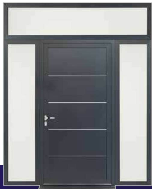
WESTMINSTER L+R+T SIDES

Overall a truly versatile addition to compliment the broadest range of bespoke Aluminium Doors.