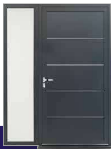
WESTMINSTER LHS SIDES