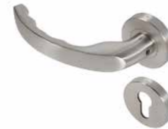
Modern Handle & Escutcheon