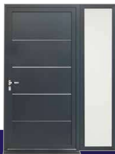
WESTMINSTER RHS SIDES