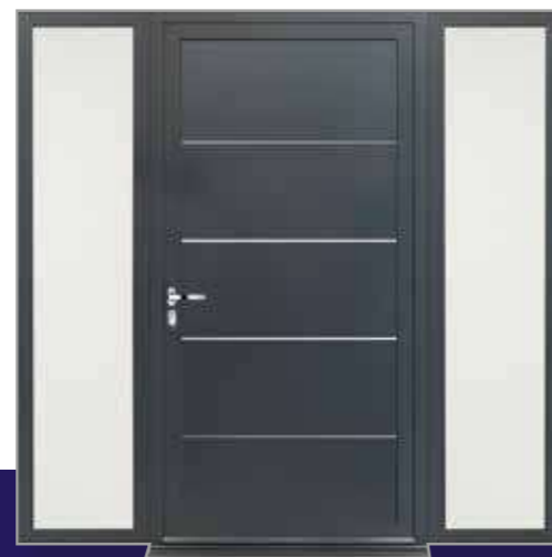
WESTMINSTER L+R SIDES