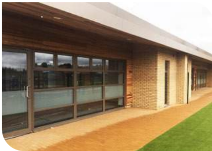
LUXBOROUGH LANE, CHIGWELL IG7