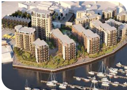
CHAPEL RIVERSIDE, SOUTHAMPTON SO14