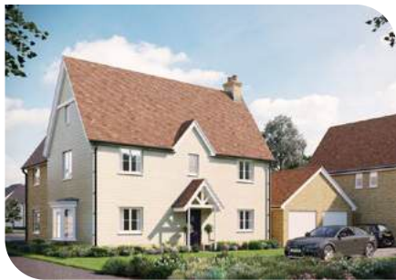
GARDINERS CLOSE, BASILDON SS14