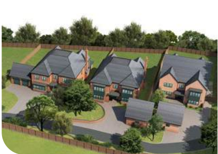
PLYMOUTH ROAD, WORCESTER B45