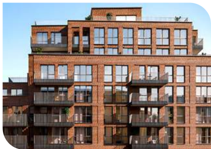
BAYFORD STREET, HACKNEY E8