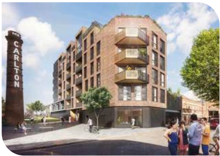
4 ROACH ROAD, BOW, LONDON E3