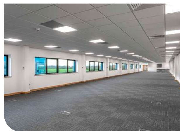
OFFICES & SHOWROOM 4,094 sq ft