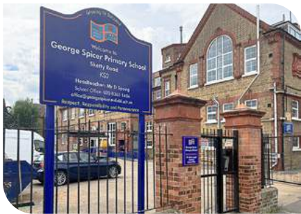
GEORGE SPICER PRIMARY SCHOOL, EN1