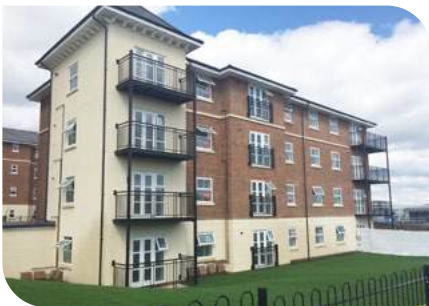
QUEENSGATE, FARNBOROUGH GU14