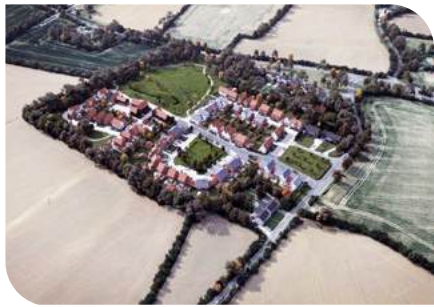
APPLETREE CRESSING, ESSEX CM77