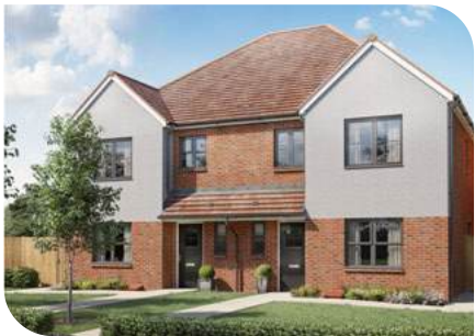
STONESHOT FARM, NAZEING EN9