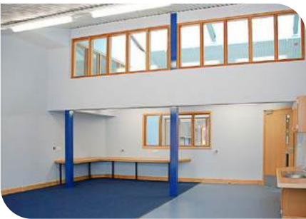
WHITEHALL PRIMARY SCHOOL, E4